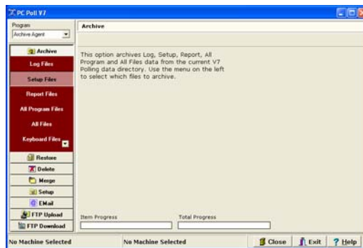
Main Screen: This is the main menu screen. From here users can enter the different areas of the program. This is the Setup Files area.