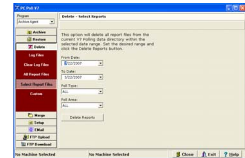
Delete Screen: From here users can Delete Log Files, All Report Files, Clear Logs and Selected Reports