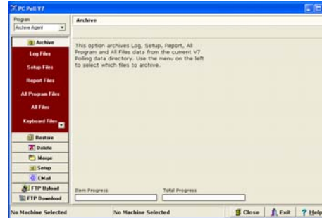
Archive Screen: From here, users can archive Log Files, Setup Files, Report Files, All Program Files, All Files, PLU/UPC files, Keyboard, Employee, and Custom Files from Polling. Also, all Data Files from Inventory and QuickBooks Interface V3.