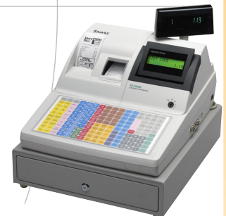
ER-5200M, ER-5215M and ER-5240M