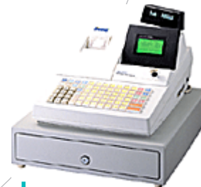
ER-650, ER-650R and ER-655II