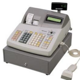
ER-A420 and ER-A410