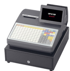
UP-810F, UP-820N, UP-820F