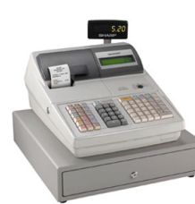
ER-A520 and ER-A530