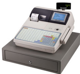
UP-600 and UP-700